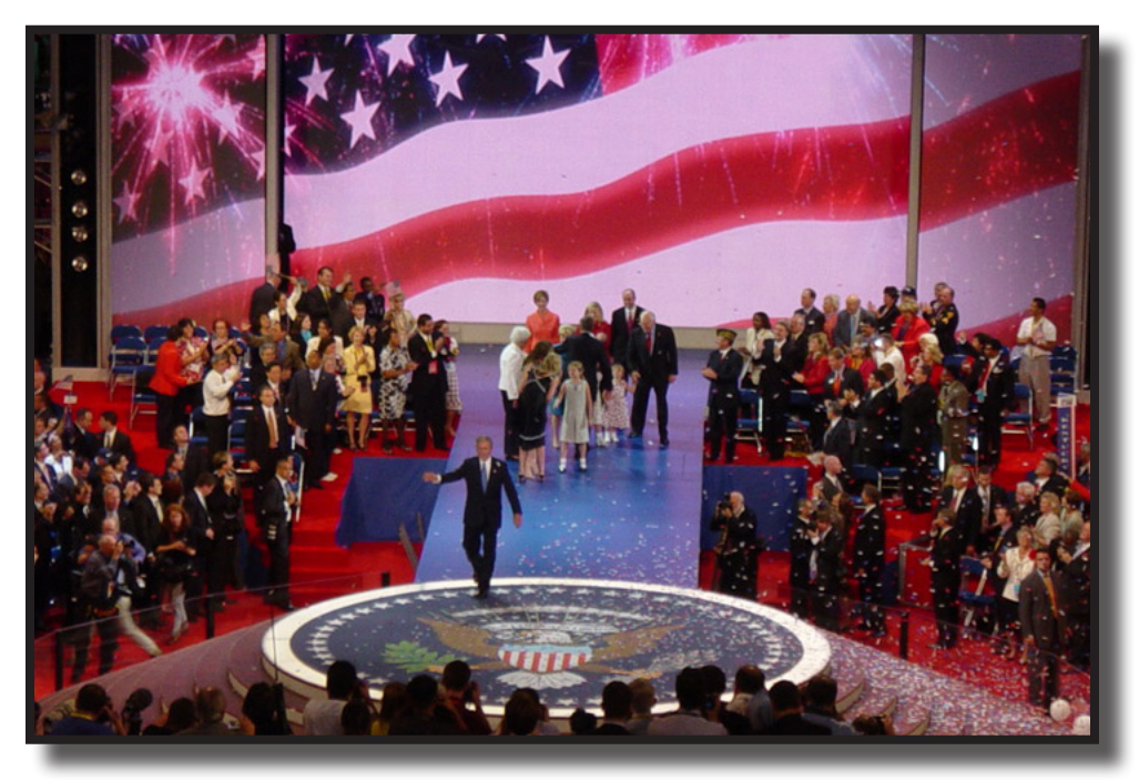
President George W. Bush at the 2004 Republican National Convention