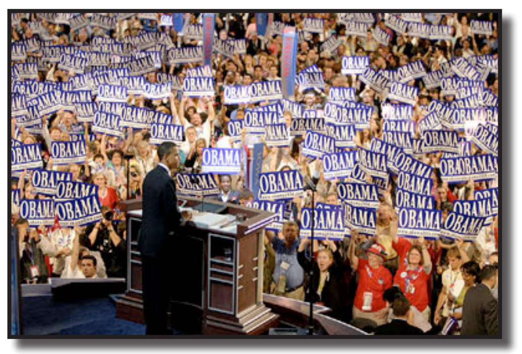
Senator Barack Obama at the 2008 Democratic National Convention